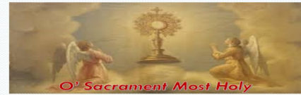
O' Sacrament Most Holy O' Sacrament Divine. All Praise and all Thanksgiving, be every moment Thine...

Sacred Heart Church Inverell Saturday 6.00pm (5.30pm from May to August) Sunday 9.00am Monday, Tuesday and 1st Saturday 9.30am Wednesday and Thursday 12 noon 1st Friday Mass and Benediction 12 noon First Wednesday Anointing Mass 12 noon McLean Village Each Friday except 1st Friday 11.00am Sacrament of Reconciliation Saturday 8.15am - 9.15am Sunday 8.00am - 8.30am Tingha St. Francis' Church Saturday 4.00pm (Saturday 3.30pm from May to August) Ashford St Patrick's Church 1st & 3rd Sunday 11.00am Bundarra St Mary of the Angels 2nd Sunday 11.00am Yetman St Joseph the Worker 5th Sunday 11.30am Baptism (Saturday only) 11am; Marriages and Funerals by Appointment