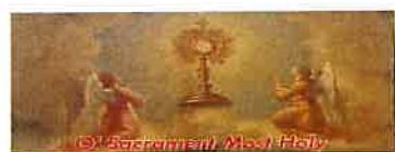
O' Sacrament Most Holy O' Sacrament Divine. All Praise and all Thanksgiving, be every moment Thine...

October being the month of the Most Holy Rosary the rosary will be prayed 30 minutes before every Mass